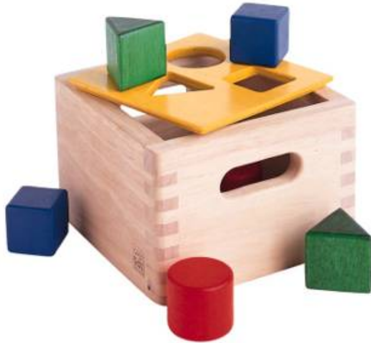
Figure 2.2: Box and blocks analogy from childhood memory: the holes on one end correspond to input templates, the holes on the other end correspond to output templates. Imagine blocks going in through one and out through the other. The blocks themselves correspond to input or output files with attached metadata . Profiles describe how one or more input blocks are transformed into output blocks, which may differ in type and number. Granted, I’m stretching the analogy here; your childhood toy did not have this magic feature of course!

so-called profiles . A profile defines input templates and output templates . The input templates and output template can be seen as “slots” for certain filetypes and metadata. An analogy from childhood memory may facilitate understanding this, as shown and explained in Figure 2.2: